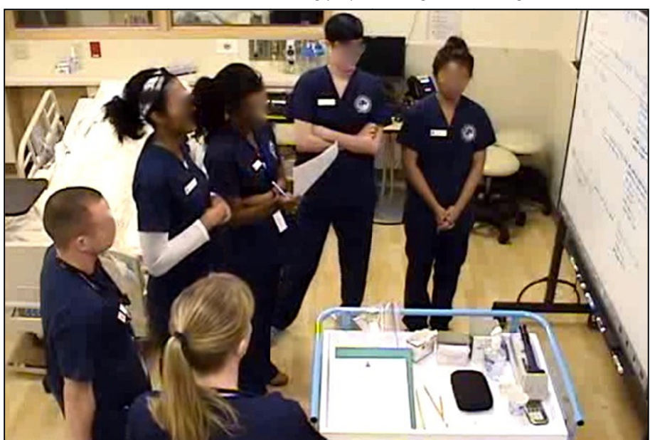
Figure 1: Two groups of nursing students participate in a handoff using the white board and their notes to guide the conversation.

During the course of each simulation, three groups of 2-3 students provide care for the patient for approximately 20 minutes while the other 6-8 students watch a video stream of the simulation in a nearby classroom. At the end of their turn, the group rejoins the rest of the class to debrief with instructors and students about the effectiveness of their communication and care. Following debrief, the outgoing group gives a handoff to transfer patient information to the next group, often informed by their charting on the large white board as well as individual note sheets they have carried with them during the simulation (see Figure 1). While an instructor modeled the handoff for each group at the beginning of their simulation by introducing their patient, there was little additional instruction about the handoff itself during my observations. Thus, students approached the handoff by drawing on observations of their instructors, peers, and preceptors in simulations and hospital contexts and previous lessons on communication. Focal student interviews provided additional access to their thinking processes during the simulated handoff and the role their writing played during this exchange.