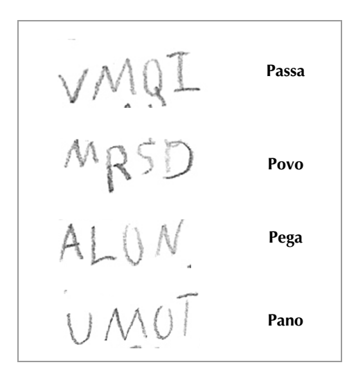
Figure 1. Example of pre-syllabic spelling produced by a child of the control group.

In the post-test none of the children in the Control Group used conventional letters to represent the initial phoneme in the words. Figure 1 shows an example of this type of spelling.